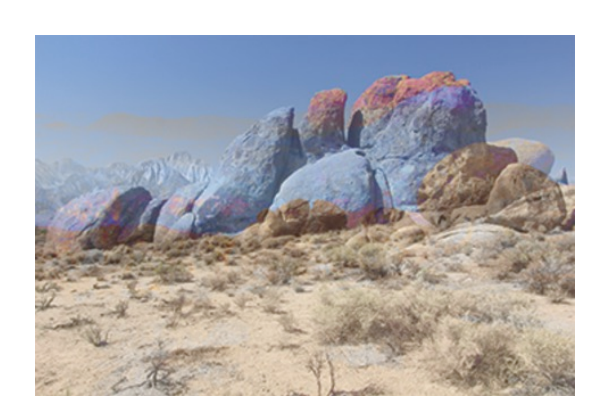
Psychedelic Western #5

digital photograph Victoria Lucas, 2016, image: courtesy of the artist