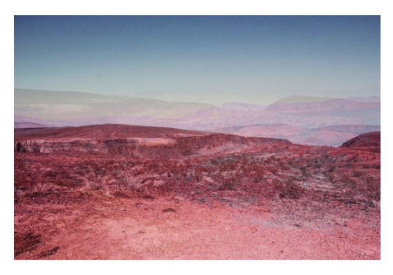
Psychedelic Western #6

digital photograph, 101.6cm x 152.4cm (image size), white box frame, Edition of 5, Victoria Lucas, 2015, image: courtesy of the artist